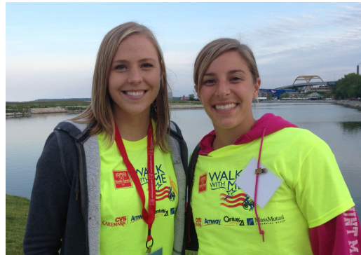
Two of the many volunteers who made our walk successful