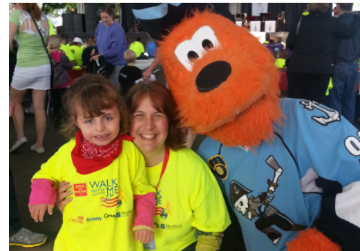
Fun with Roscoe from the Milwaukee Admirals!

The Milwaukee lakefront provided a beautiful backdrop for Walk With Me and Polish Fest is a wonderful host sponsor.