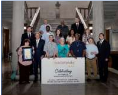
Governor Bill Haslam Presents 100 th Year Proclamation