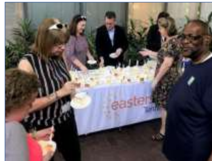
Celebrating With Cake on April 22nd