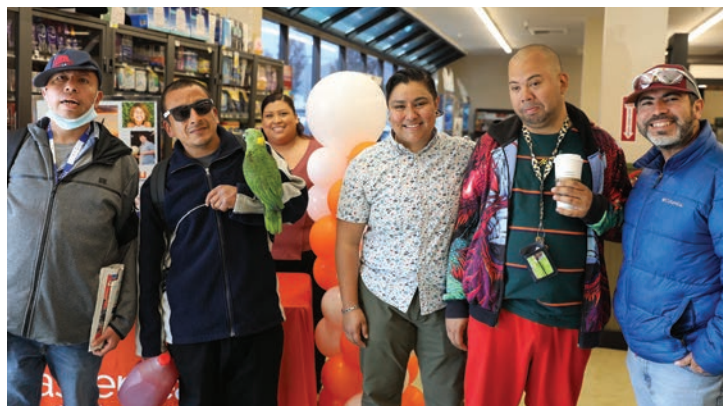
Staff and participants from ESSC Adult Day Services visit Albertsons to support the in-store fundraising campaign earlier this year.

The foundation recently presented ESSC with a $100,000 grant that will support our Severe Behavior Services programs.