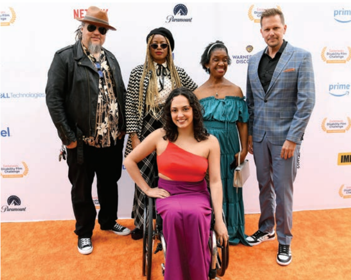
Filmmakers who participated in the Easterseals Disability Film Challenge gather prior to the awards presentation at Sony Pictures.