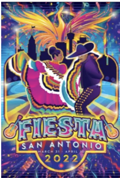
Easter Seals Rehabilitation Center