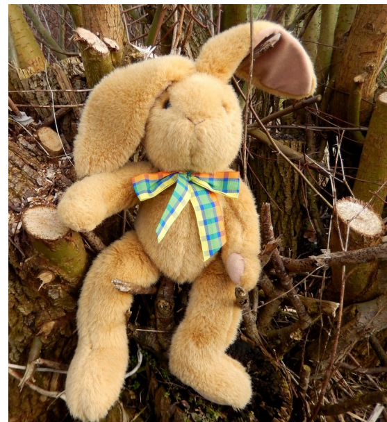
Easter Seals Rehabilitation Center