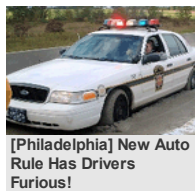
[Philadelphia] New Auto Rule Has Drivers Furious!