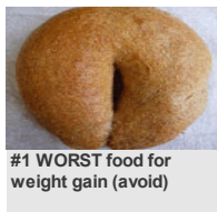
#1 WORST food for weight gain (avoid)