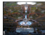
Citi Field/Flushing Meadows