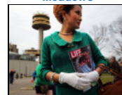
World's Fair 50th