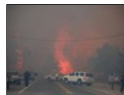
Ocean County Forest Fire