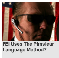
FBI Uses The Pimsleur Language Method?