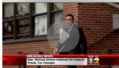
Rep. Michael Grimm Charged In 20-Count...