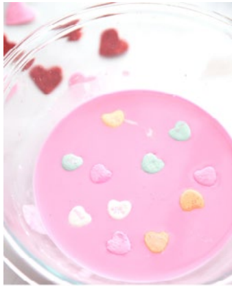
Heart Oobleck Valentine's Day Science

Enjoy some loving activities and fun ideas for February