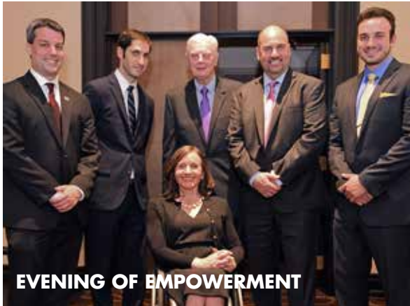
EVENING OF EMPOWERMENT

Easter Seals MA hosts several different events across the state in which raise funds to support our important mission. There are many ways our donors and volunteers get involved, some for decades with our long running events such as Softball and others more recently with our newest event FuntoberFest.