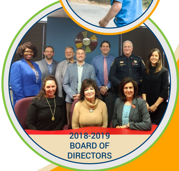
2018-2019 BOARD OF DIRECTORS