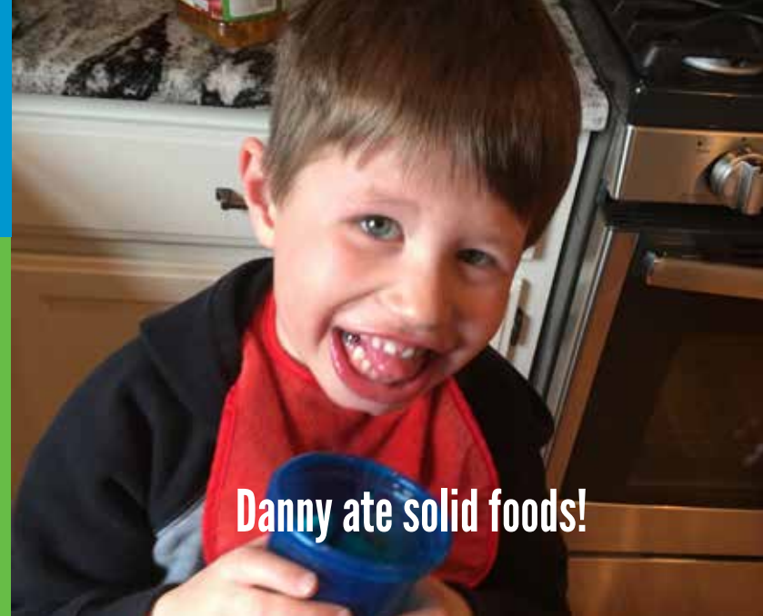
Danny ate solid foods!

We provided early intervention services to 1,074 children throughout Chicagoland