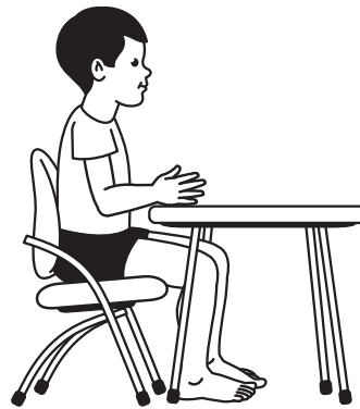
Figure 2. Correct position when sitting