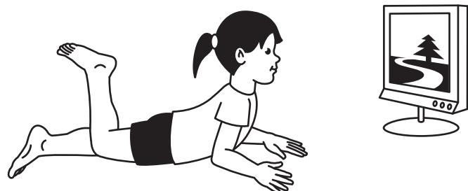
Figure 4. Lie on the tummy and stretch the back