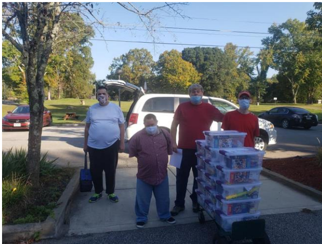
Our friends in Lawrence County delivering activity packs during the Pandemic to our home-based clients.

As I look back on the last year and a half of life during a pandemic, I want to reflect on the many blessings we received at Easterseals. While the world prepped for the onslaught of COVID-19 our staff began preparing for the many contingencies that could occur. Their plans often had contingency plans. They found innovative ways to serve and engage our participants. I am very grateful for their commitment to those we serve.