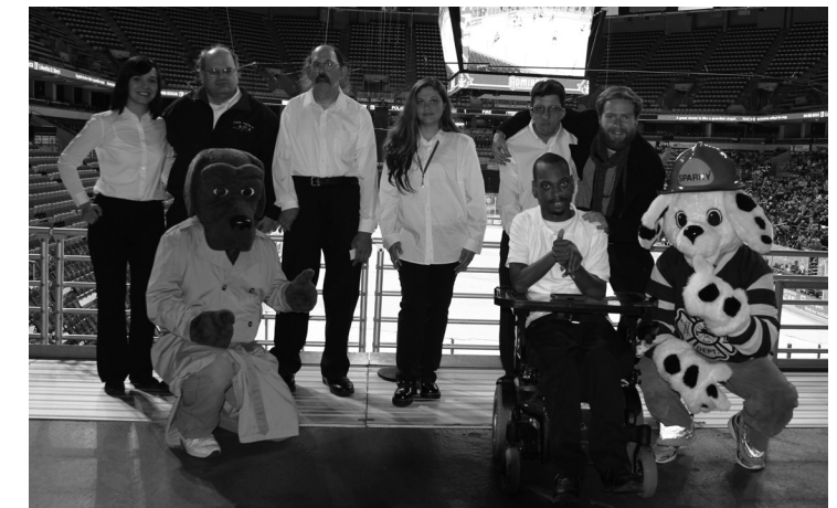
Easter Seals Colorguard

Tuesdays: 6/7-8/9. *No program 7/5. 5:00 - 7:00 p.m. *Time changed from last session. MAXIMUM: 10 Free This program is FREE to all interested participants, however, you must commit to consistent attendance. Pre-registration is still required. Previously held at our Tosa Center, the Easter Seals Colorguard program is now open to recreation participants. We will practice flag and marching routines, and we will have several performances throughout the year at sporting events and other venues. Routines are simple and easy to learn for individuals at all skill and ability levels. Don't worry, we will teach you!