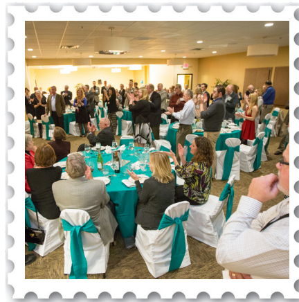
LilyWorks Conference Center