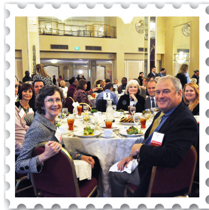
Some of the 233 Attendees