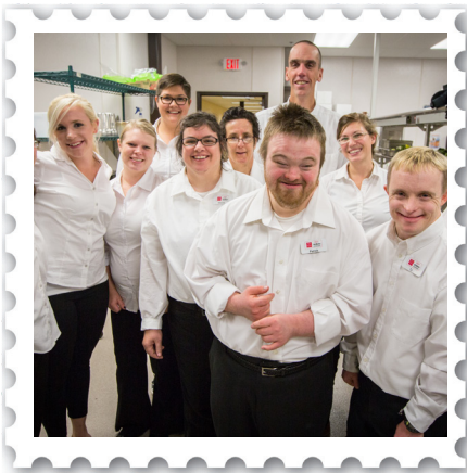
Easter Seals catering trainees and staff