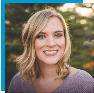
Favorite Camp Song: The Shark Song