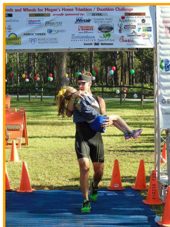
Heels And Wheels Duathlon & Triathlon