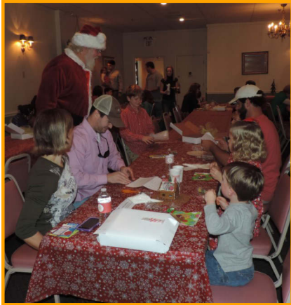
“Let’s Get Ready to Crumble” Gingerbread Family Festival