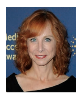
Message from our Chief Advancement Officer