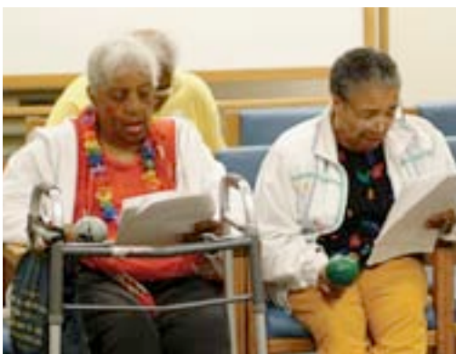
Lower left: Seniors enjoy a musical interlude at an Easter Seals Adult Day program.