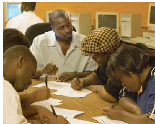
Top left: Everyone gets into the act at camp.

Easter Seals partners with health and human service organizations as well as public and private insurers to provide life-changing services and support for children and adults living with autism and other disabilities and special needs and for their families.