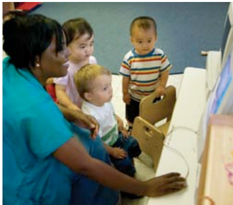
Above: A learning activity for the youngest learners at Easter Seals.