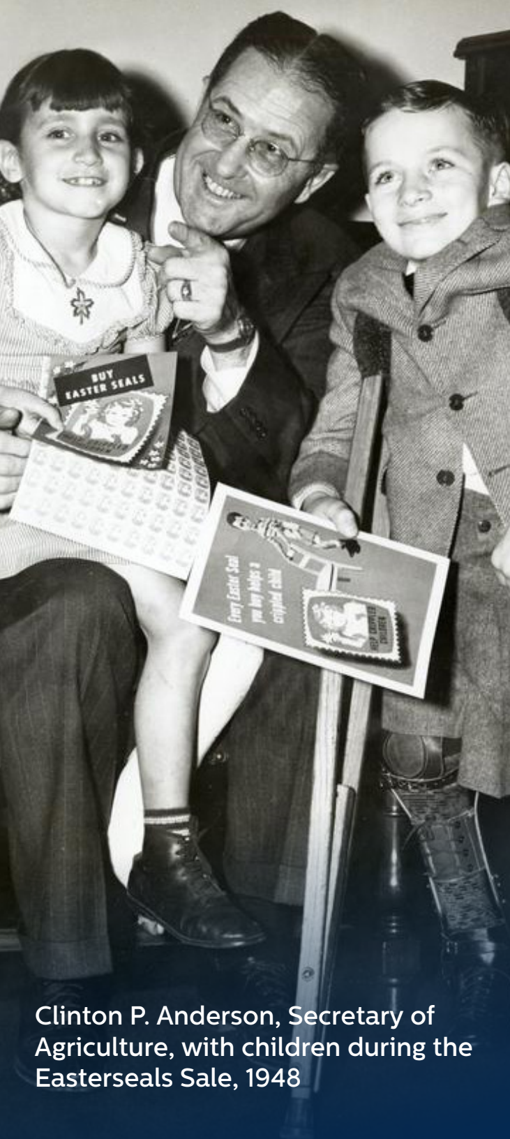
Clinton P. Anderson, Secretary of Agriculture, with children during the Easterseals Sale, 1948