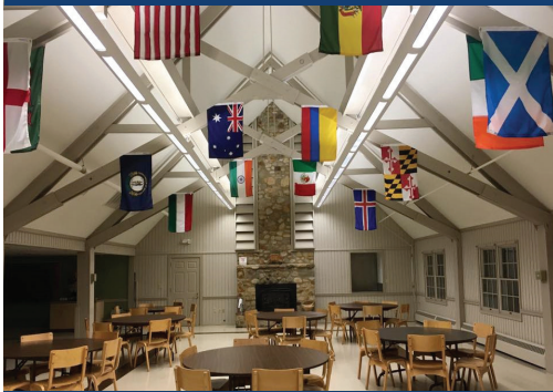
Renovated Dining Hall