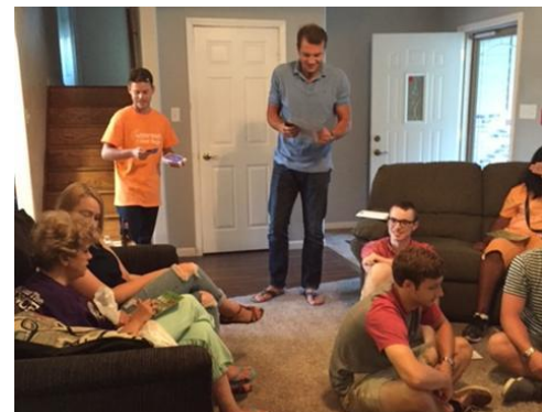
Young Professionals host a summer sizzler at one of our residential homes.