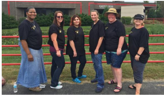
Caterpillar volunteers paint the fence and plant mums at our Barney location.