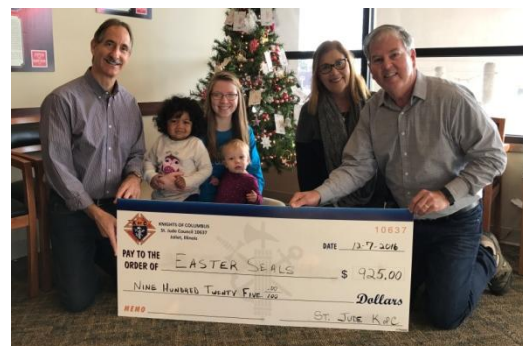
Knights of Columbus St. Jude Council #10637 presents a check to Easterseals for the holiday season.