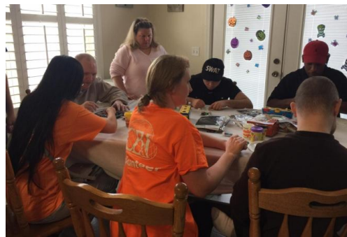
Volunteers from Chicago Bridge & Iron helping out at our Plainfield residential home.