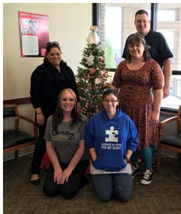
Century 21 Affiliated Joliet office wraps presents for our residents and decorates our two offices for the holidays.