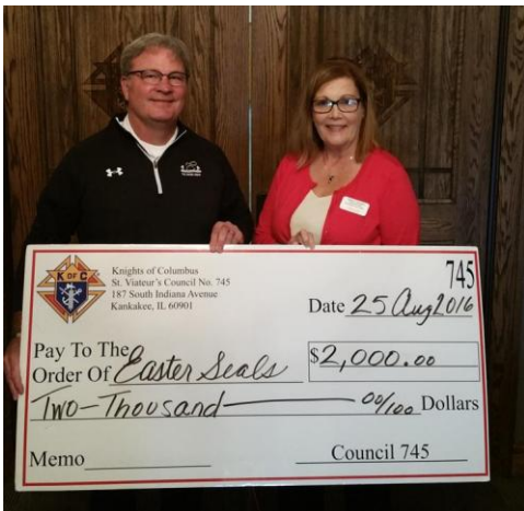
Knights of Columbus St. Viateur's Council #745 presented a check for $2000.