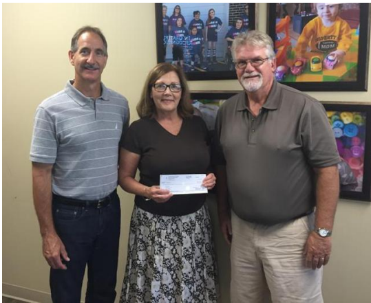
Knights of Columbus St. Jude Council #10637 presents a check to Easterseals' summer programs.