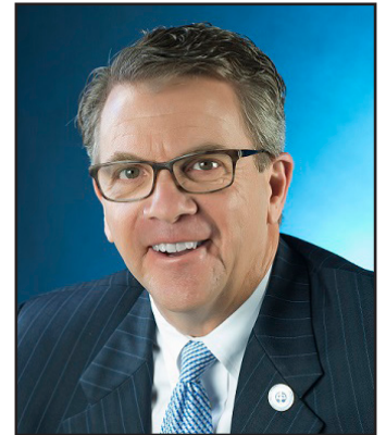
Mayor Lloyd Winnecke

Thank you, Mayor Winnecke, for your personal commitment to the principle that "e is for everyone." Your leadership will continue to make a difference for years to come! ●