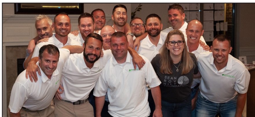
Thank you, members of the Sean Roy Hilt Foundation!

Since 2015, the Foundation has funded hundreds of therapy sessions at the Easterseals Rehabilitation Center, changing lives for local people who couldn't otherwise afford those essential services. Foundation members have also made a direct impact on many individuals, giving the precious gifts of hearing, speech, mobility, and independence.