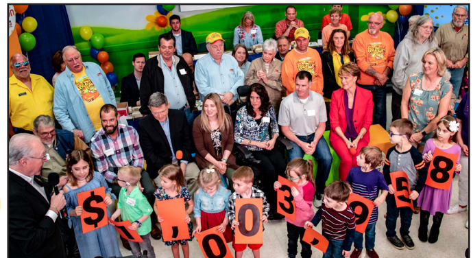
Children display the "final tote" at the Telethon on WEHT Local.