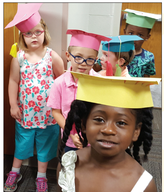
Excited graduates line up for ceremonies at the Dan & Nancy Mitchell Therapeutic Preschool on May 19.