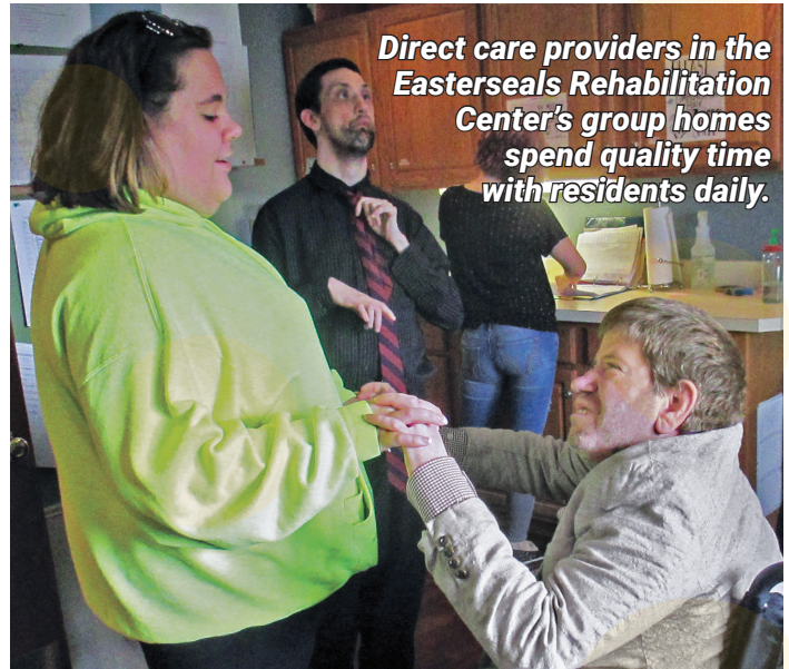
Direct care providers in the Easterseals Rehabilitation Center's group homes spend quality time with residents daily.

Full-time employees work 30 or more hours a week and are eligible for benefits. Earn up to $12 per hour. No experience necessary—we'll train you! Candidates must be at least 18, have reliable transportation, have a high school diploma or GED or pass a reading test, must be able to lift 70 pounds and must pass all pre-employment checks.