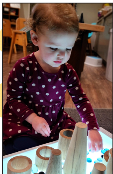
Even in challenging times, committed staff members at the Easterseals Early Learning Center help kids of all abilities create bright futures. More on Page 5!