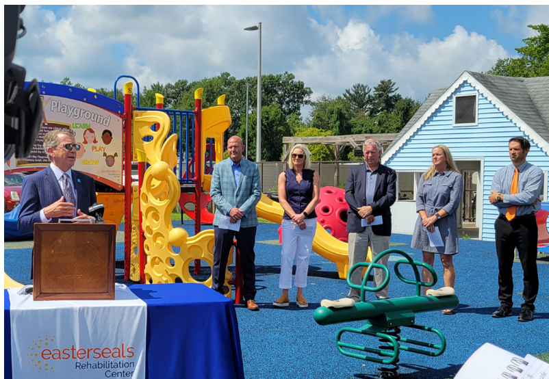
Above, Mayor Lloyd Winnecke speaks at the press conference announcing the public phase of the “Ensuring the Future” campaign

On August 11, the Easterseals Rehabilitation Center launched a multi-million-dollar public fundraising campaign to sustain and expand its psychology services for area children and families.