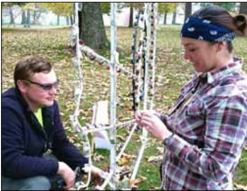
Ritzzy's Fantasy of Lights raised approximately $160,000, the second best year in the event's 24-year history, thanks to Ritzzy's, IBEW, NECA, Electrical JATC, Teamsters, and many other generous supporters.