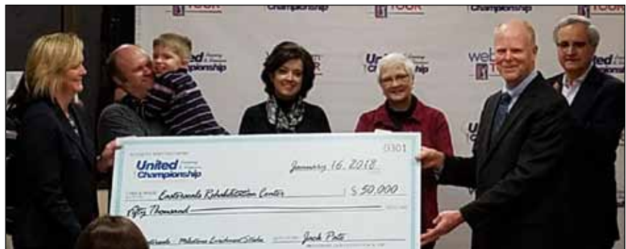
Golf Gives Back, the charitable organization made possible by the United Leasing & Finance Championship, presented its first Impact Grant to fund a new Art Enrichment Studio at the Easterseals Early Learning Center.