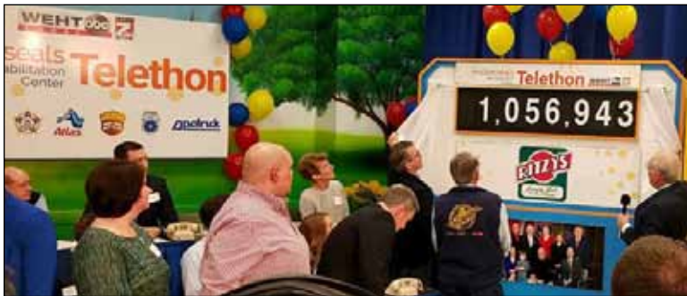
The "final tote" for the 41st annual local Easterseals Telethon reached a record $1,056,943. All proceeds fund therapy, thanks to our very generous friends at WEHT Local/Local 7 WTVW.