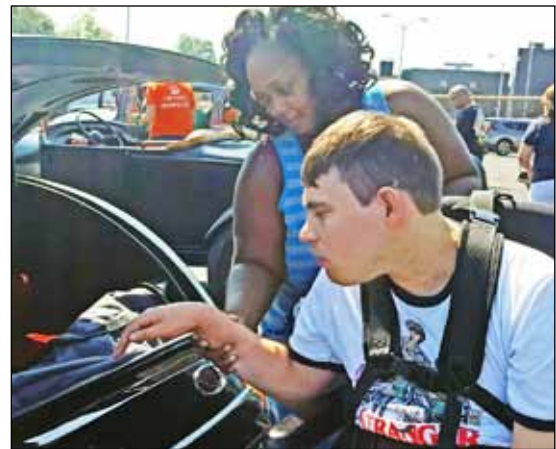
Clients of Aspire Adult Day Services enjoyed a visit from the E'ville Iron Street Rod Club, who brought their vehicles for a close-up look.