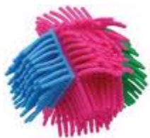
Square Tentacle Ball

Orange and blue z-shaped stretchy strands can be stretched and will return to its previous shape much like a yo-yo. (Image to left)