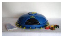
The New Touch

4 piece textured puzzle with lights, music and vibration, 6 AA batteries. (Image to left)