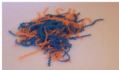
Ziggy Pasta Yo-yo

Rubbery material in various forms (centipede, worms, etc) ideal for tactile stimulation. (Image to left)