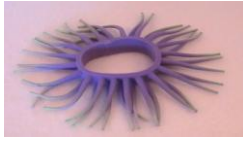
Urchin Stretch Band