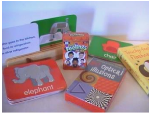
Photo Feelings Fun Book