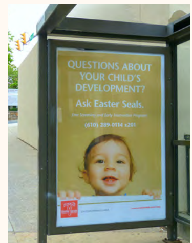
Advertising in bus shelters throughout the Allentown NIZ.

With the support of these grants, we anticipate conducting 400 free screenings with follow-up support along with a classes for parents and training of child-care staff.