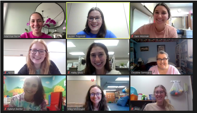
Seven Easterseals therapists working on their DIR Floortime coursework with instructors

Our clinicians are continuous learners, receiving time for mentoring and further education to facilitate each child's development with child-led, play-based care. This includes specialties and certifications in: