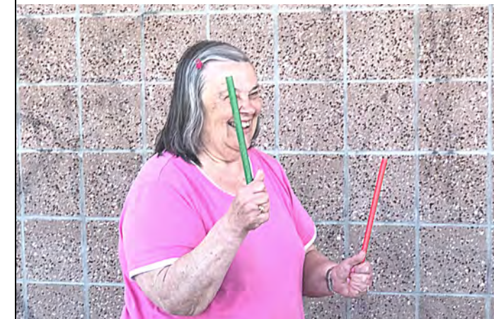
PROGRAMS | Page 4 of 30