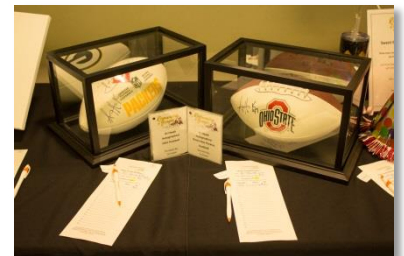
A couple of AJ Hawk Autographed footballs were offered during this year's expansive silent auction.

Thank you to all who took the time out of their busy schedules to attend Romancing the Grape. Everyone from our volunteers, to the patrons who attended the event... we thank you. The programs we provide in our own backyards would not exist without your support.