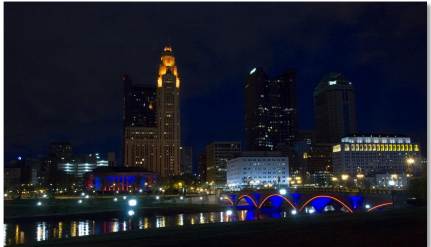
Leveque Tower "Lighting it up Orange" to celebrate Easterseals 100 th anniversary. This kicked off the week of Romancing the Grape, thanks to an anonymous donor.