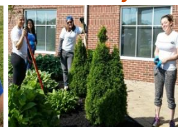
BMW Financial Volunteers helping landscape