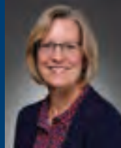
General John "Jay" Raymond, USSF (Ret) & Mrs. Mollie Raymond*