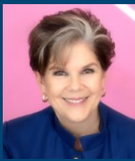
Phebe Novakovic General Dynamics Chair